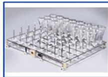
Injection Rack (BKIR60)