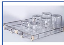
Beaker Rack (BKBR01)