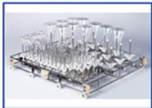
Combined Rack (BKIR11218)